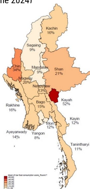
Map 2. Proportion of households with a low food consumption score (April–June 2024)

According to a Myanmar Household Welfare Survey based on seven rounds of surveys between the December 2021 to February 2022 period and the April–June 2024 period, Shan reported the third-highest proportion (29%) of households with a low food consumption score in 2024 , as shown in Map 2 (IFPRI 11/2024). Data from the WFP indicates that, until late 2023, around 25% of households in conflict-affected parts of Shan state were experiencing inadequate food consumption. Many of these households have been forced to adopt coping strategies with negative outcomes, such as reducing the size and frequency of meals or selling essential livelihood assets to meet basic needs (IFPRI 11/2024; WFP 02/10/2023; OCHA 05/04/2024).