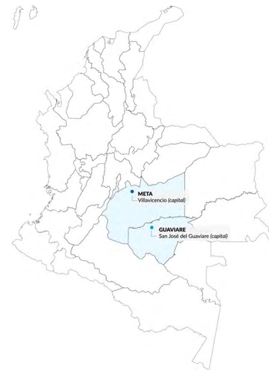
Map created by Action Against Hunger.