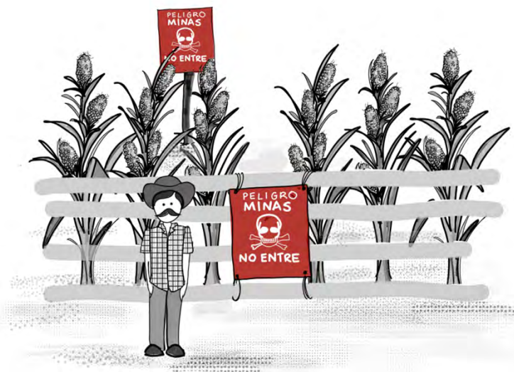
Illustration by Sandie Walton-Ellery.

Mobility restrictions enforced by armed groups during certain hours of the day increase transportation costs, as fewer vehicles circulate (MIRE 11/10/2021; Mascolombia 28/08/2021).