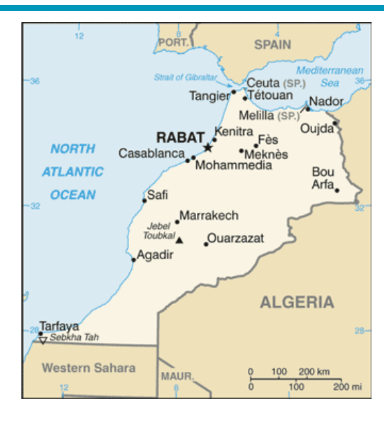
Map of Morocco

Anticipatory briefing note - 18 December 2018